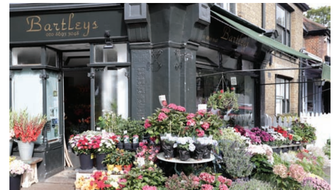
Characterful shop front in Dulwich Village

Where possible signwriting should be used. Signs may be illuminated with appropriate projecting light fittings. Illuminated back lit signs will not be approved.